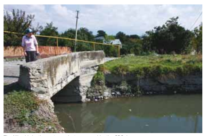
The Nikosi irrigation water project, managed by the CPC, has provided water pumps and pipes to supply river water to the large Saltvisi irrigation channel, for the benefit of farmers affected by the August 2008 conflict in Georgia. June, 2011.