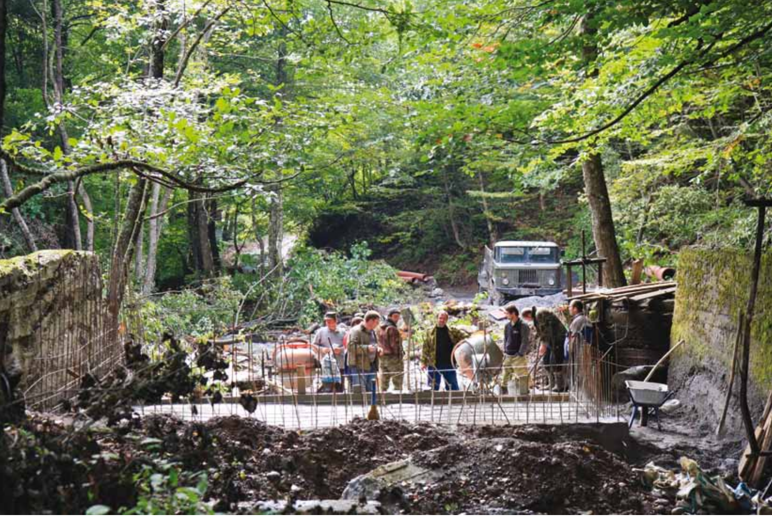
Repair work on the intake of the Znauri water distribution network, being rebuilt in an EU-funded OSCE project, managed by the CPC, to build confidence in the region affected by the August 2008 conflict in Georgia. From the intake, a nine-kilometre pipe will bring potable water to Znauri.