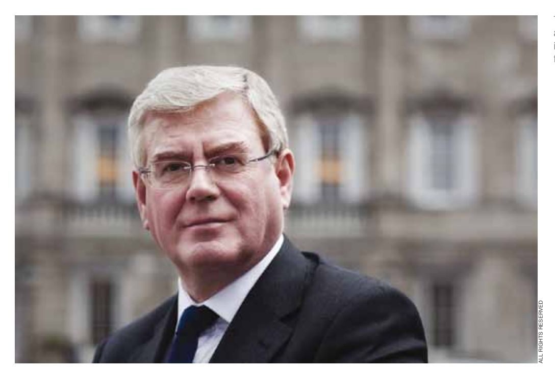
Tánaiste and Minister for Foreign Affairs and Trade of Ireland, Eamon Gilmore, the incoming Chairperson-in-Office of the OSCE for 2012.

INTERVIEW WITH THE INCOMING CHAIRPERSON-IN-OFFICE OF THE OSCE