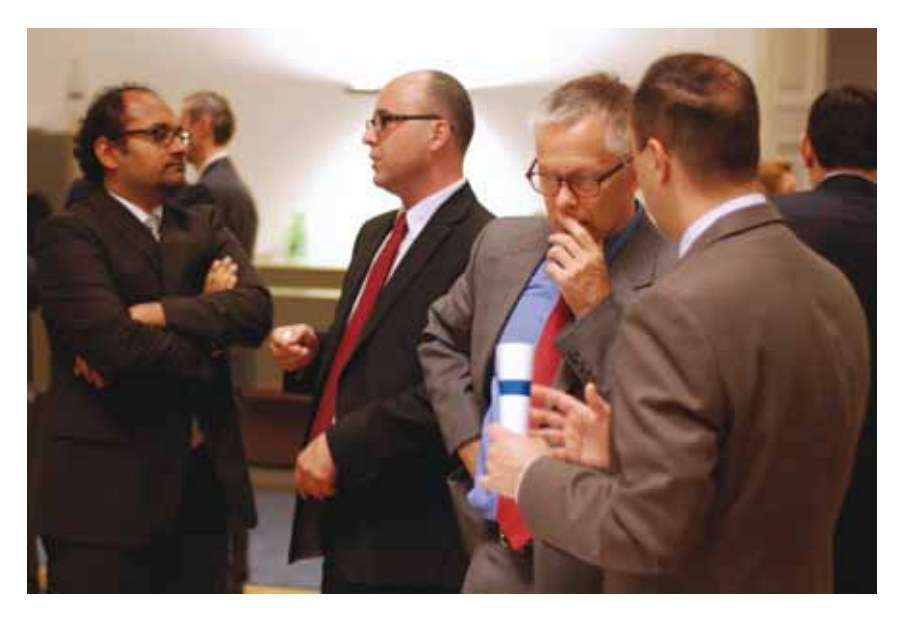
Participants in the V to V Dialogue expert meeting on strengthening the mediationsupport capacity of the OSCE, speaking during a break, Vienna, 12 July 2011.

ince 2009 the OSCE Conflict Prevention Centre has been assisting three Chairmanships — Greece, Kazakhstan, and Lithuania and the participating States in strengthening the Organization's responsiveness to conflict in all its phases.