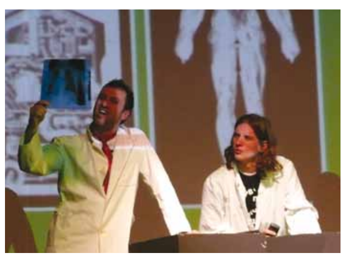
Premiere of the play, Same in a Different Way, produced by the OSCE to raise awareness of the role of the ombudsperson institution in protecting from discrimination, Skopje, 18 October 2010. (Pristop, MK)

In the beginning there was one. The Ombudsperson Office of the former Yugoslav Republic of Macedonia began its work in July 1997 with the election of the country's first Ombudsperson. Since then, with the support of the OSCE Mission to Skopje, the Office has developed into an institution with six regional offices and some 80 staff members, all dedicated to safeguarding the rights