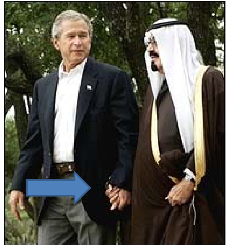
Ap Crawford Ranch April 2004