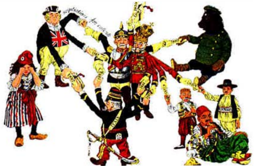
Political cartoon depicting the tangled web of European alliances of the late 19th century. Note Marianne, representing France, crying alone in the bottom-left corner thanks to German chancellor Otto von Bismarck's (pictured in the center) successful attempts to keep her isolated from the rest of the European powers.