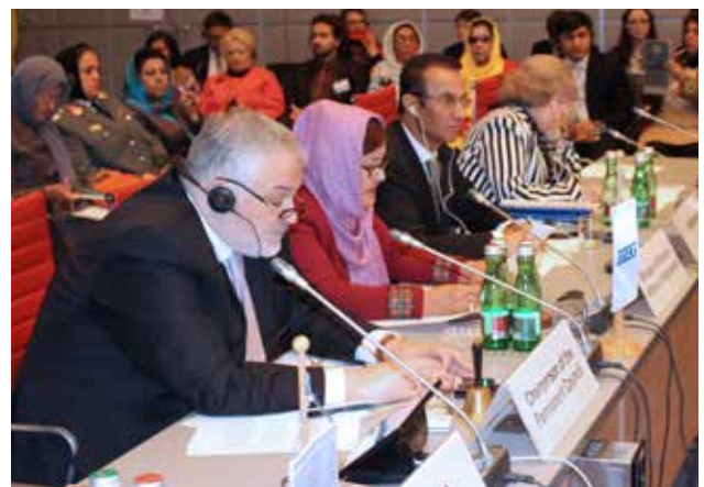
Minister of Women's Affairs of Afghanistan Dilbar Nazari updates the OSCE Permanent Council on progress in the area of women's empowerment in Afghanistan. Vienna, May 2015.

Women's engagement as civil leaders and public officials both signals and heralds more inclusive forms of politics and governance. Institutions and families with more gender equality can shift the composition of