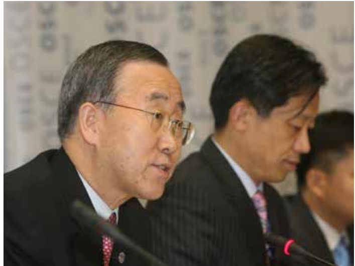
Republic of Korea Foreign Minister Ban Ki-moon (2004-2006) chairing a meeting of the Asian Partners to enhance mutual understanding of security challenges affecting Europe and Asia. Ljubljana Ministerial Council meeting 2005.