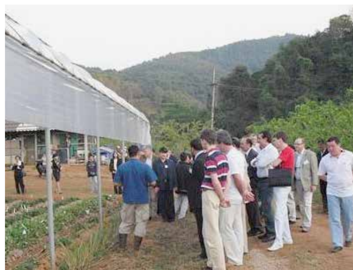
Visit to the Royal Project in Chiang Mai province within the workshop on “Combating Illicit Crop Cultivation and Enhancing Border Security and Management: Thailand as a Case Study”, January 2010.