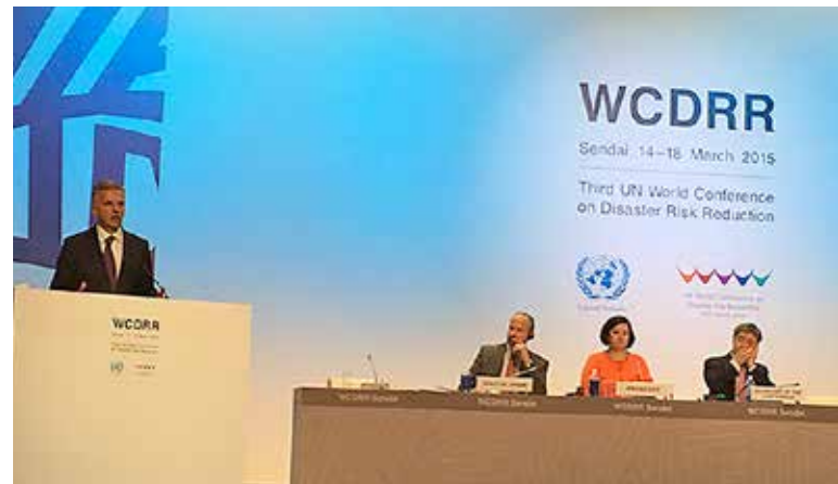
Swiss Foreign Minister Didier Burkhalter stresses the importance of disaster risk reduction for safeguarding sustainable development at the Third UN World Conference on Disaster Risk Reduction (WCDRR), Sendai, Japan, 14-18 March 2015.

The importance of the linkages between environmental security and gender roles has been supported by a wide range of research and impact assessments. Women play decisive roles in managing and preserving biodiversity, water, land, and other natural resources, especially