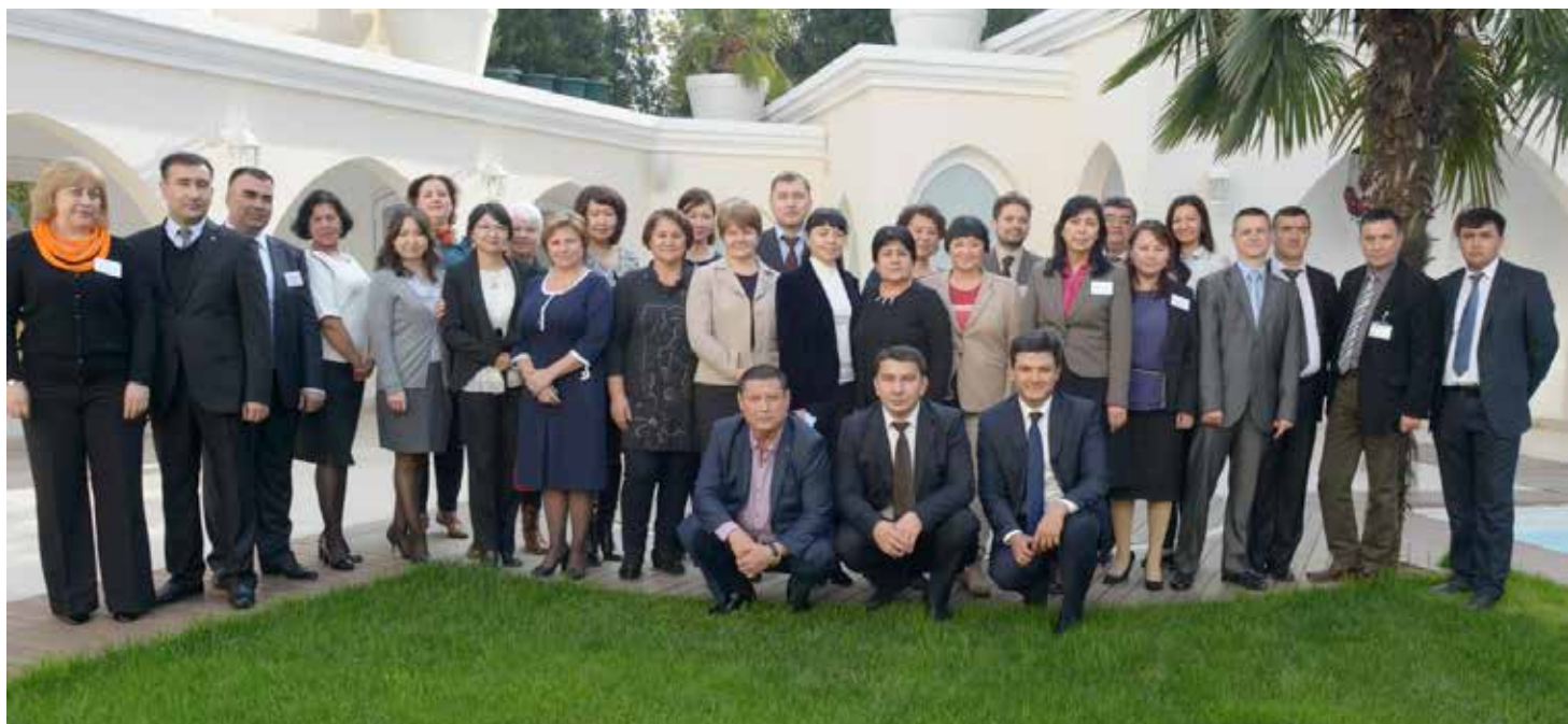
Regional round table for Central Asian State officials, Istanbul, Turkey, November 2014.