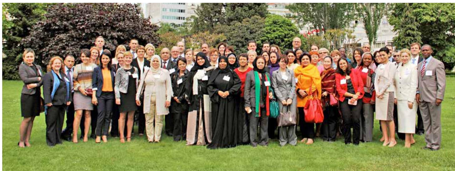
Participants gather outside the GCTE-OSCE International Workshop on women's empowerment and countering VERLT. Istanbul, Turkey, May 2014.

and addressing specific political, social, economic, cultural, or educational concerns that may lead to violent extremism and terrorist radicalization. The lack of such involvement constitutes a practical obstacle to women's engagement against VERLT and undermines women's contributions to the prevention of terrorism. 9