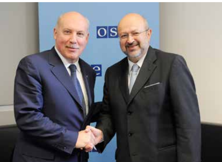
OSCE Secretary General Lamberto Zannier with SCO Secretary General Dmitry Mezentsev after having addressed the OSCE Permanent Council, July 2013.