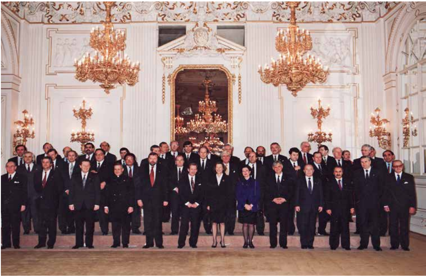
Meeting of the Council of Ministers for Foreign Affairs in Helsinki, March 1992.

a substantial relationship with non-participating States, such as Japan, which display an interest in the CSCE, share its principles and objectives, and are actively engaged in European co-operation through relevant organizations. To this end, Japan will be invited to attend CSCE meetings, including those of Heads of State and Government, the CSCE Council, the Committee of Senior Officials and other appropriate CSCE bodies which consider specific topics of expanded consultation and co-operation. Representatives of Japan may contribute to such meetings, without participating in the preparation and adoption of decisions, on subjects in which Japan has a direct interest and/or wishes to co-operate actively with the CSCE.” Japan attached importance to present its views, the so-called “right to speak” when necessary.