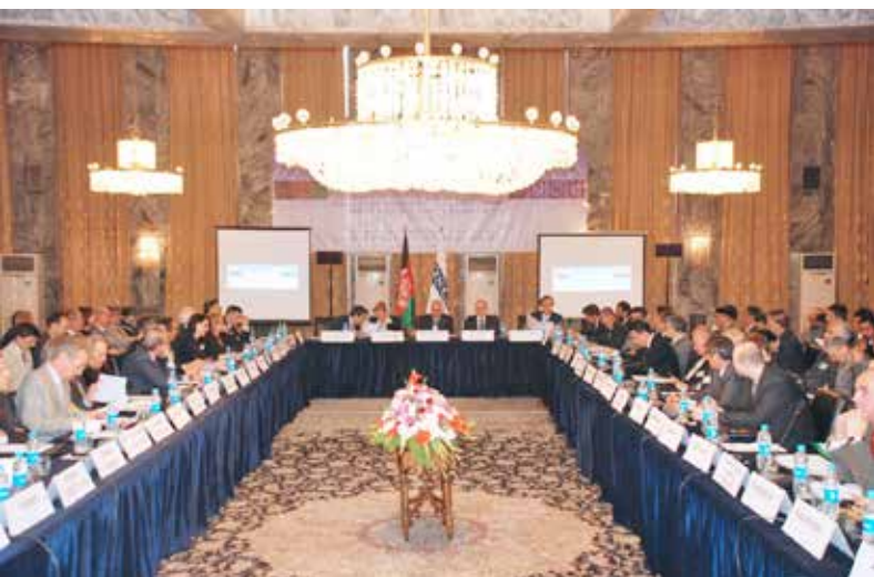
2008 OSCE-Afghanistan Conference. Kabul, Afghanistan, 9 November 2008. (Ministry of Foreign Affairs of Afghanistan)

fight against corruption and the recovery of stolen assets, sustainable energy and water management feature alongside disaster risk reduction, small arms and light weapons and many others, demonstrating the range of issues of common interest. In recent years, several of the Asian Partners have shown a particular interest in the OSCE as a possible model for security co-operation in East and Northeast Asia and in the OSCE's experience in implementing CSBMs through multilateral co-operation.