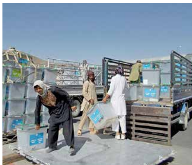
ODIHR election observation in Kabul. Unloading of ballots, International Security Assistance Force, Spring 2015.