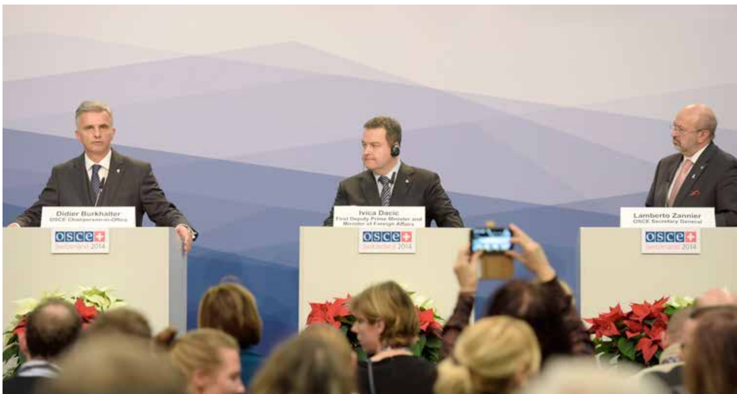
Swiss President and Foreign Minister and OSCE Chairperson-in-Office 2014 Didier Burkhalter, First Deputy Prime Minister and Minister of Foreign Affairs of the Republic of Serbia Ivica Dačić and OSCE Secretary General Lamberto Zannier at the Ministerial Council, Basel, 4-5 December 2014. (Jonathan Perfect)

The year 1995 marked another important milestone in the history of the OSCE Asian Partnership as it was immediately before the Ministerial Council in Budapest on 5 December 1995 that the Permanent Council decided to apply the term "Partners for Co-operation" to Japan and the Republic of Korea. This allowed for the creation of a framework for more States to join the Partnership: in 2000, Association of Southeast Asian Nations (ASEAN) member Thailand became an OSCE