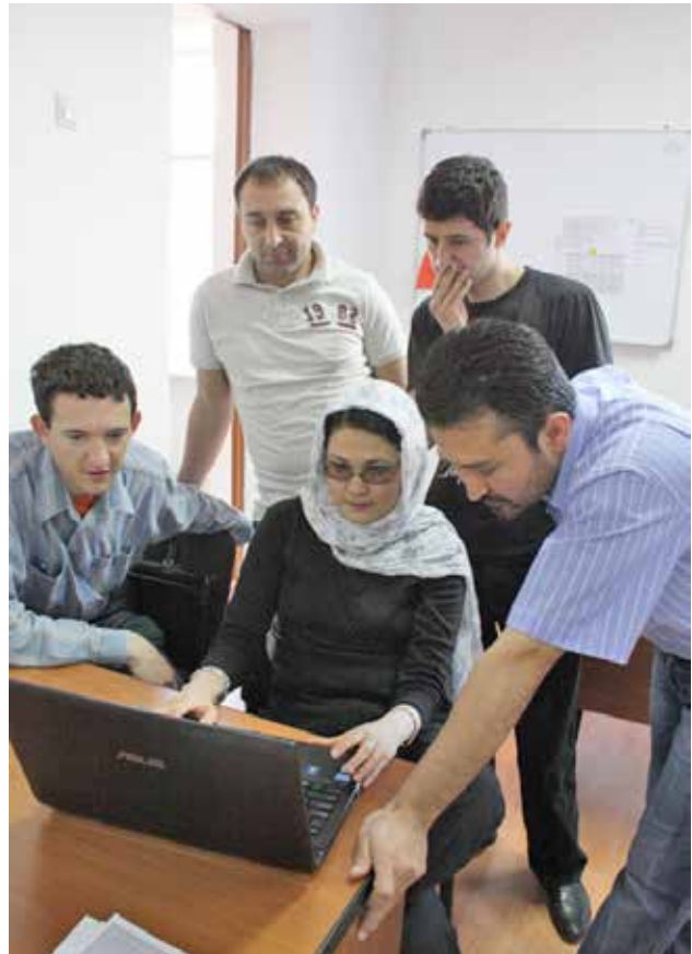
A MA programme class at the OSCE Academy in Bishkek, April 2012.

As the security situation in Afghanistan will continue to affect the stability of Central Asia and the OSCE area at large, the Organization will continue to rely on its field presences in the five Central Asian participating States to provide targeted assistance in key areas and to promote regional security, stability and economic development. In so doing, the Organization will work with other international actors such the European Union and the United Nations, as well as with the Conference on Interaction and Confidence-Building Measures in Asia (CICA), the Collective Security Treaty Organization (CSTO) and the Shanghai Cooperation Organisation