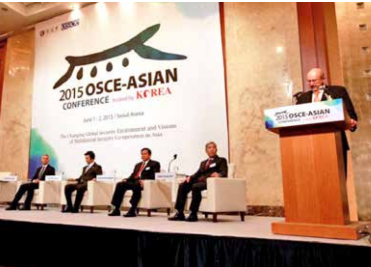
OSCE Secretary General Lamberto Zannier addresses the participants in the 2015 OSCE Asian Conference in Seoul, Republic of Korea.