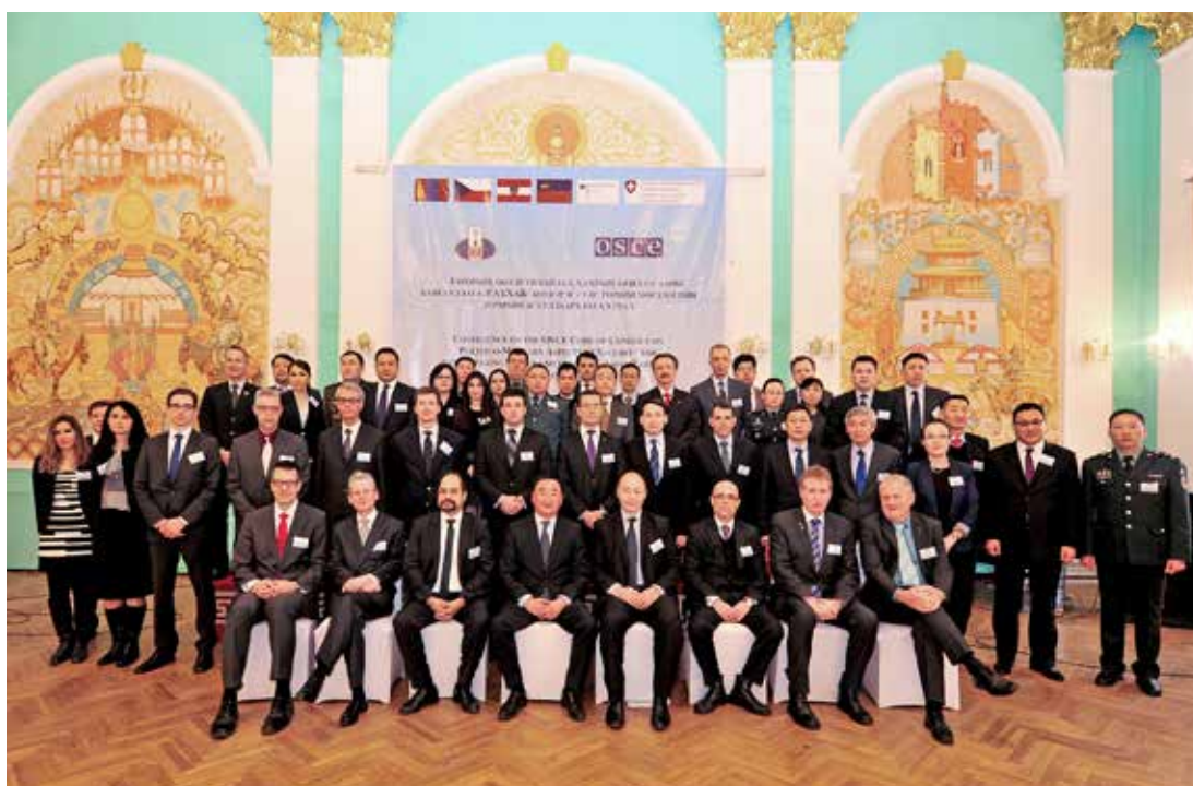
Participants of a three-days conference on the OSCE Code of Conduct for Central Asia and Asian Partners for Co-operation, Ulaanbaatar, Mongolia, 10 March 2015.