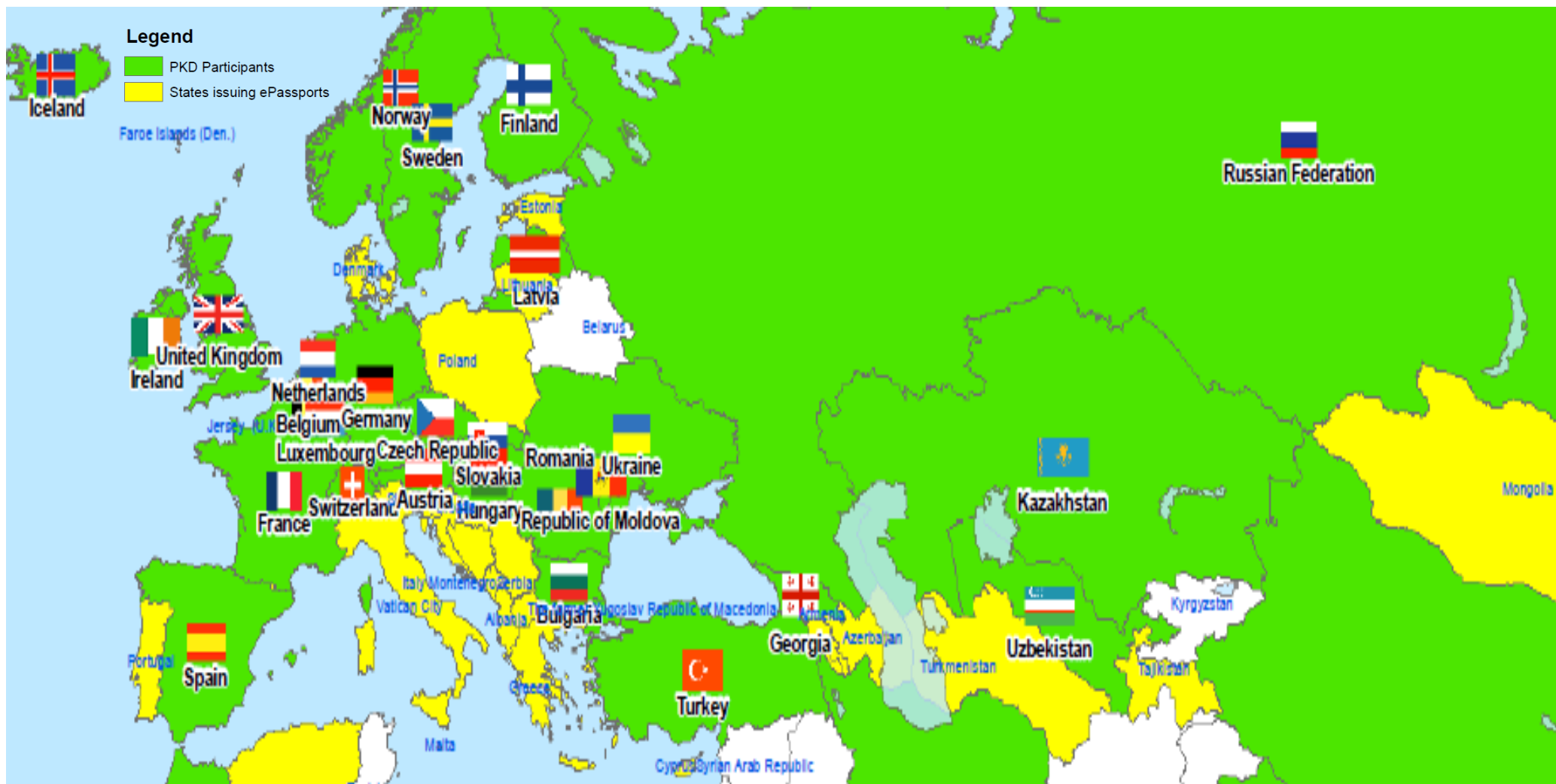
Annex 2 - Magnified section of ICAO PKD Membership Map in the OSCE Region