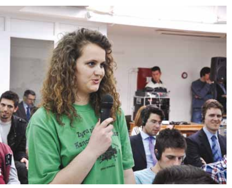
This page and page 24: OSCE High Commissioner on National Minorities Knut Vollebaek (photo bottom right: centre) meets students at the multilingual university department in Bujanovac, Serbia, March 2012.