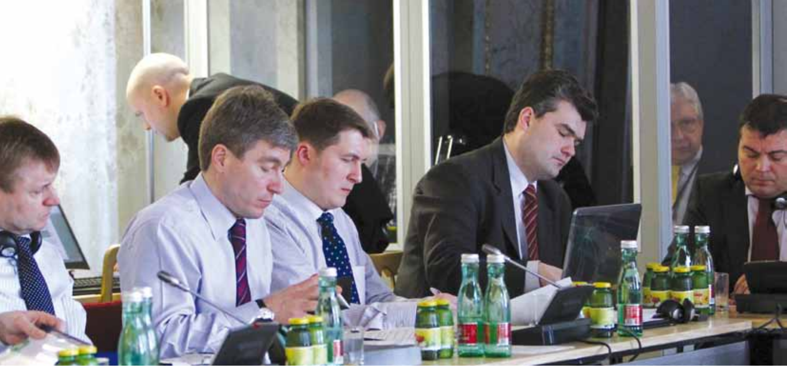
5+2 talks in Vienna, 18 April 2012. Second from left: Eugen Carpov, Moldovan Deputy Prime Minister and chief negotiator

co-operation together, of enhancing the cooperation at all levels, the quicker we will be able to address the more difficult aspects of a final settlement.