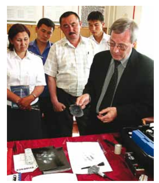
Police training in Bishkek. The Office of Internal Oversight evaluated OSCE police training activities in Kyrgyzstan and also in Serbia and the former Yugoslav Republic of Macedonia from 2009 to 2010.