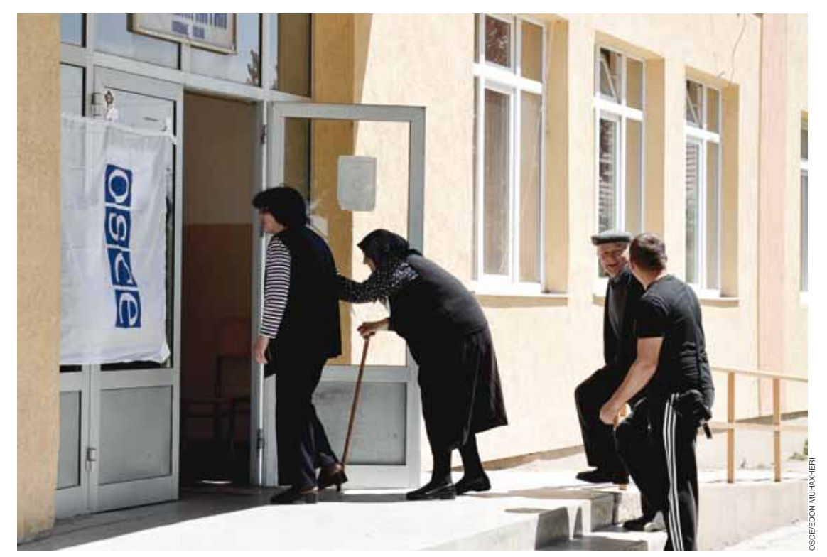
Voters in the village of Laplje Selo, an ethnic Serb enclave in Gracanica/Graçanicë municipality near Prishtinë/Priština, enter an OSCE-organized polling station to cast their ballots in the first round of the Serbian presidential and parliamentary elections, 6 May 2012.

understanding and expressed appreciation for the role being assumed by the OSCE.