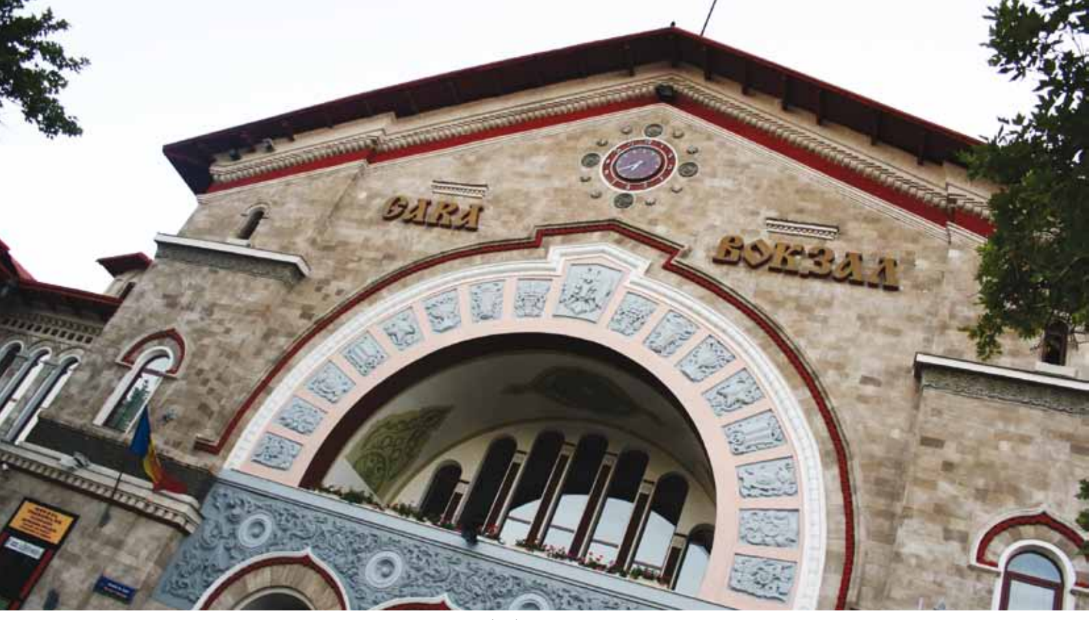
INTERVIEW WITH AMBASSADOR ERWAN FOUÉRÉ, THE SPECIAL REPRESENTATIVE OF THE CHAIRPERSON-IN-OFFICE FOR THE TRANSDNIESTRIAN SETTLEMENT PROCESS