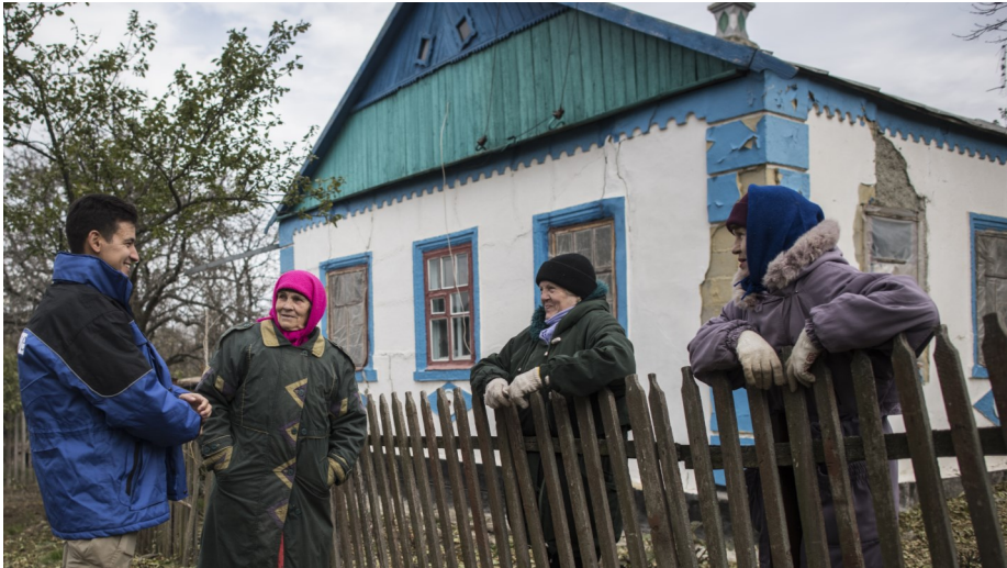
An OSCE SMM monitoring officer engaging with civilians in eastern Ukraine.