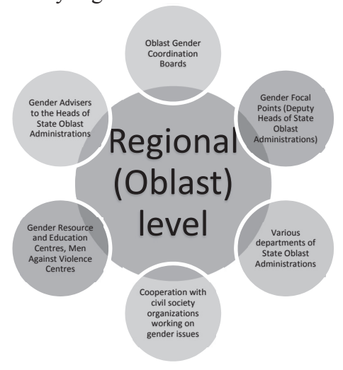
Scheme of Gender Equality Mechanisms at the regional (oblast) level

In addition, during 2008-2011, gender advisers were appointed to the Heads of SOAs in 16 regions. 13 regional Gender Resource Centres and 21 regional Gender Education Centres were set up. 19 regional SOAs established co-ordination boards on family, gender equality, demographic development, the prevention of domestic violence and combating human trafficking. For the purposes of this Study, the focus of the analysis presented below is on the role of gender advisers, gender co-ordination boards, gender centres and opportunities arising from co-operation with civil society organizations.