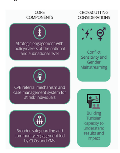
Figure 1: The Jendouba Model

drawing on Dutch and other international good practices. The first 18 months of the programme worked to establish a feasible model, led by the police in close collaboration with the municipal government and other community-based resources.