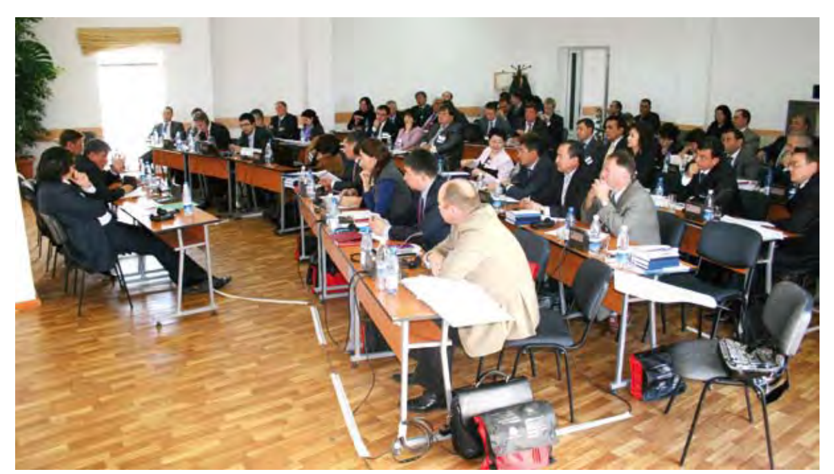
Participants attending the fourth annual ODIHR Expert Forum on Criminal Justice for Central Asia at Issyk-Kul, Kyrgyzstan, on 15 October.