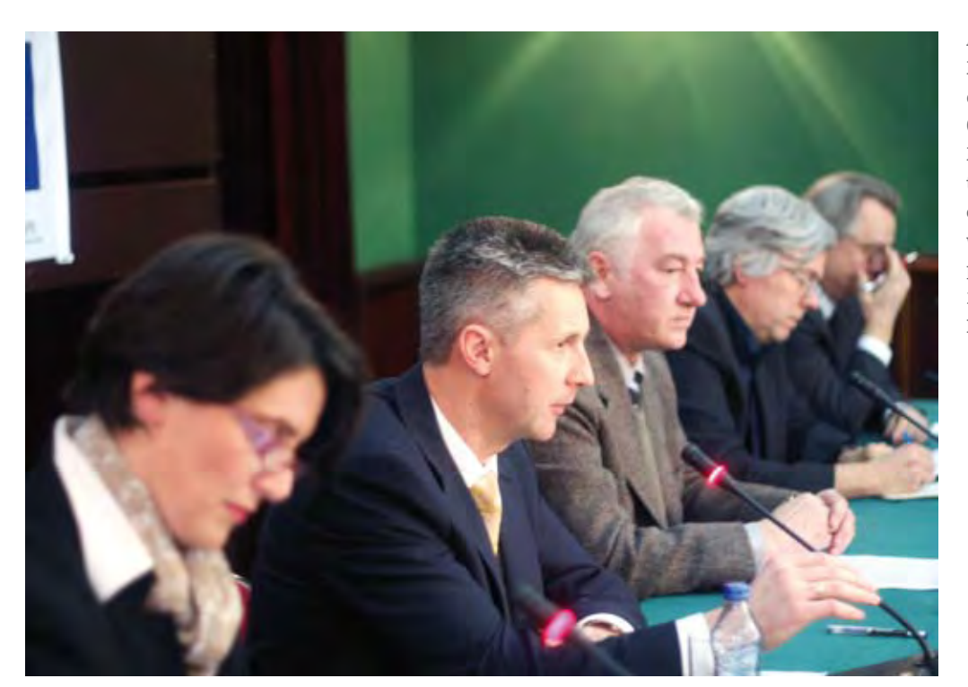
Artis Pabriks, former Foreign Minister of Latvia and head of the OSCE/ODIHR Election Observation Mission to Montenegro (centre), speaks to journalists at a postelection press conference with colleagues from parliamentary delegations, 30 March.

the end of 2009, the Office was in the process of updating or developing publications on a wide variety of issues, including the participation of national minorities in electoral processes, legal frameworks for elections, new voting technologies, voter registration, campaign finance and guidelines on media monitoring.