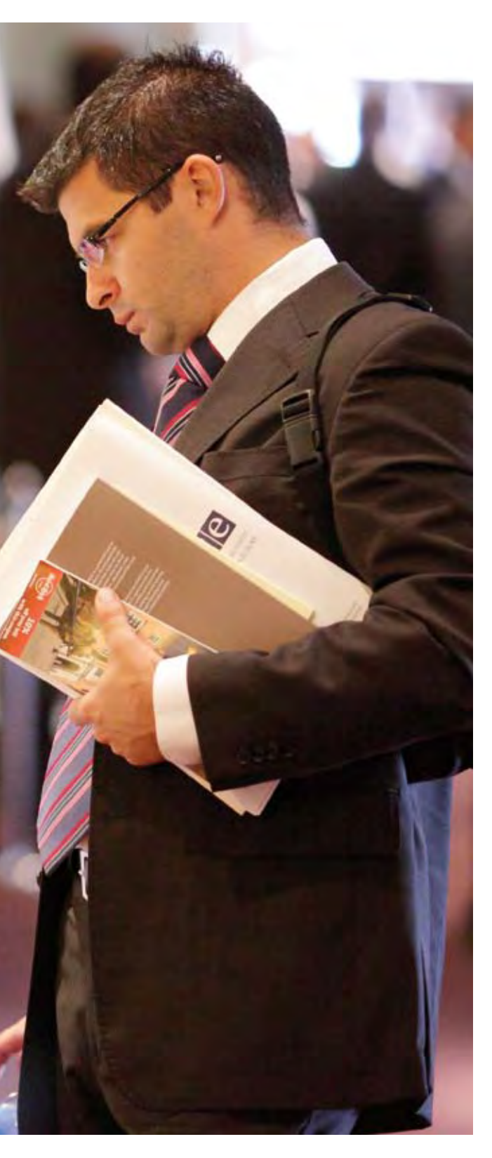
A participant at the Human Dimension Implementation Meeting, Warsaw, 28 September - 9 October.

SCE participating States have undertaken numerous commitments to combat racism, xenophobia, anti-Semitism and other forms of intolerance, including against Muslims, Christians and followers of other religions. Despite this, violations of human rights and fundamental freedoms continue to threaten stability and security throughout the OSCE region. Accordingly, ODIHR works with participating States and a broad network of non-governmental bodies to defend freedom of thought, conscience, religion and belief and to eliminate manifestations of intolerance in order to build cohesive communities in which diversity and pluralism are seen as assets to democratic and pluralistic societies.