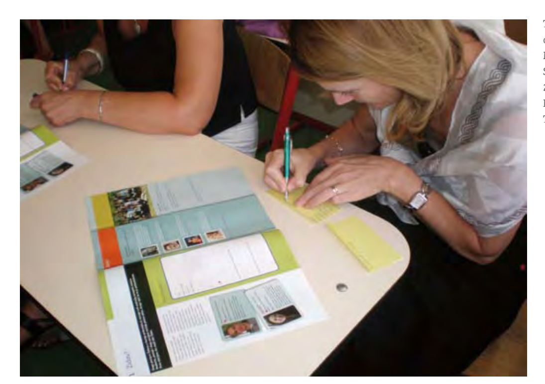
Training for Croatian teachers on using ODIHR's Teaching Materials to Combat anti-Semitism, Split, Croatia, 2 September.

pioneering "Law Enforcement Officer Programme on Combating Hate Crime", a comprehensive training initiative covering various aspects of hate crimes and police responses to them. The training programme was also conducted in Legionowo, Poland, in November, where 19 police officers from eight of the country's regions took part. The main focus of the training was to provide the participants with theoretical knowledge and practical skills so that they can pass the information down to front-line police officers in various follow-up training courses that are expected to be held at the regional level.