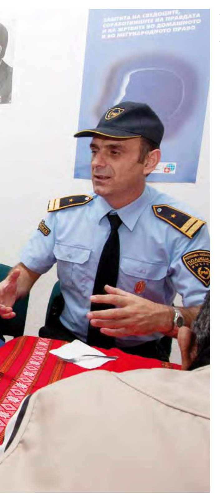
A police officer talks with representatives of the Roma community about their concerns, Skopje, 7 September.

inisterial Council Decision No. 8/09, "Enhancing OSCE Efforts to Ensure Roma and Sinti Sustainable Integration", adopted in Athens in December 2009, focuses on enhancing OSCE efforts to ensure integration of Roma and Sinti. The Ministerial Council has tasked ODIHR, in co-operation and co-ordination with the High Commissioner on National Minorities (HCNM), the OSCE Representative on Freedom of the Media and other relevant OSCE executive structures, to continue to assist participating States in combating acts of discrimination and violence against Roma and Sinti, and to counter negative stereotyping of Roma and Sinti in the media. Furthermore, it tasked ODIHR, in consultation with the participating States and in close co-operation with other relevant OSCE institutions, to develop and implement projects addressing the issue of early education for Roma and Sinti. Implementing the Ministerial Council Decision will be a priority for ODIHR in 2010.