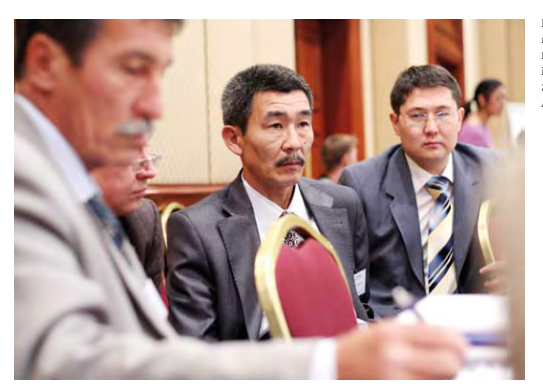
Participants in an OSCE roundtable meeting on freedom of association in Central Asia, Bishkek, 21 October.

States will find it difficult, if not impossible, to fulfil their OSCE commitments. Thus, ODIHR provides support to participating States to help them foster and sustain democratic institutions, such as political parties and parliaments.