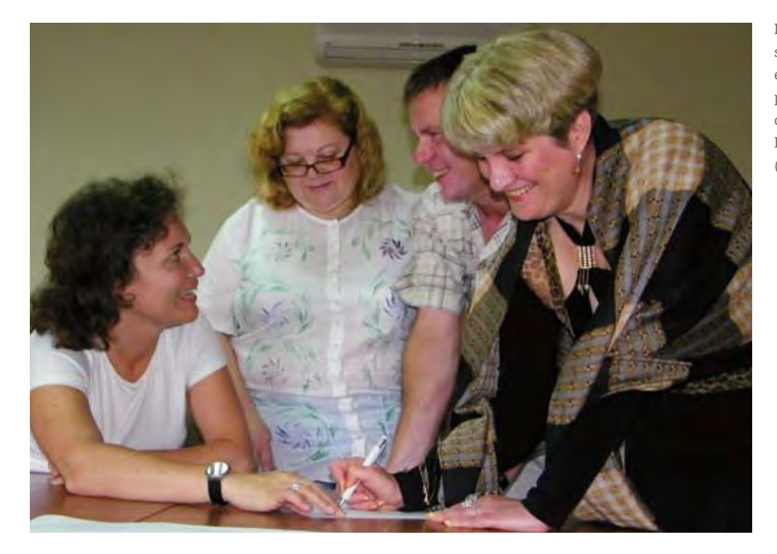
Participants at a training session on human rights education and civic participation for Belarusian civil society representatives, Lviv, Ukraine, 9 July.

which are the areas in which these individuals and groups face the gravest challenges.