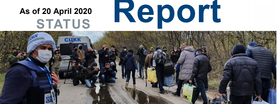
An SMM monitoring officer monitoring the mutual release and exchange of detainees near Majorsk