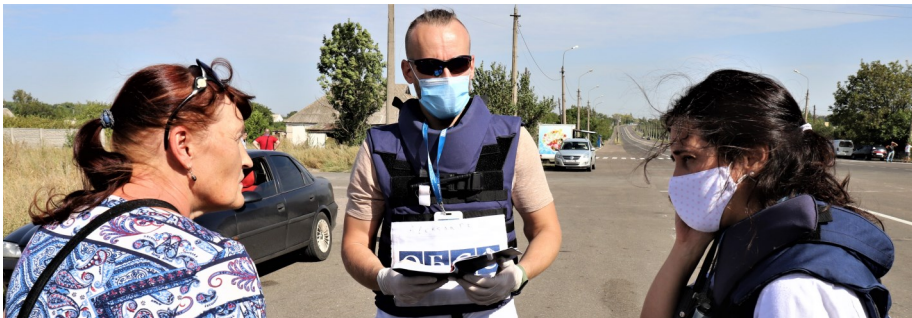
SMM monitoring officers near Olenivka, Donetsk region