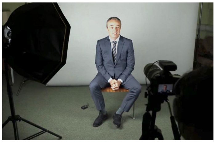
Films are produced as part of the campaign to raise awareness of more effective approaches to preventing and countering violent extremism.

The OSCE's 57 participating States and 11 Partners for Co-operation are determined to prevent and combat terrorism, in all its forms and manifestations, while upholding human rights and the rule of law. But we need everyone on board to make it happen. Let's speak up together loud and clear for peace and security!