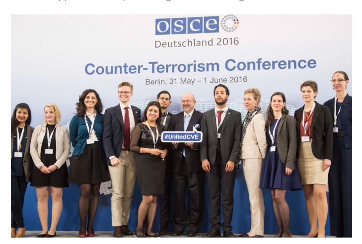
OSCE Secretary General Lamberto Zannier meets youth participants of the OSCE Counter-Terrorism Conference 2016.