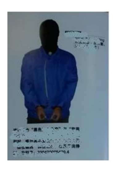
Image (left): Metal "Inquest Chair" Image (right): "Mask – for arresting" Images taken from company brochures

At the same 2016 event, the same third country company promoted the "Mask-for arresting." This device consists of a cloth hood (designed to completely block vision by covering the entire prisoner's head including nose and mouth), which is attached to metal handcuffs. In addition to concerns about the risk of asphyxiation, such systems restrict the prisoner's movements and may increase the risk of neck or other injury, for example due to falling.