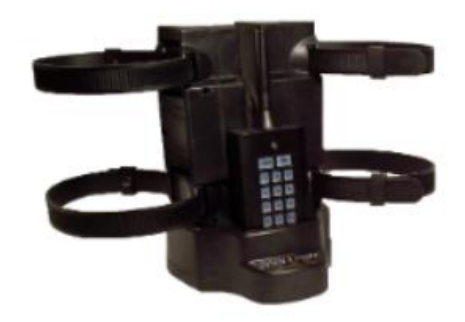
Electric shock "Stun-Cuff"

In contrast, a number of companies based in one OSCE participating State continue to manufacture and/or promote body-worn electric shock devices such as stun belts, stun vests and stun cuffs. At least one company has instructions for clients making international orders. It has been reported that this company's products have previously been tested in a second OSCE participating State, as well as in at least three third countries. |Viiii