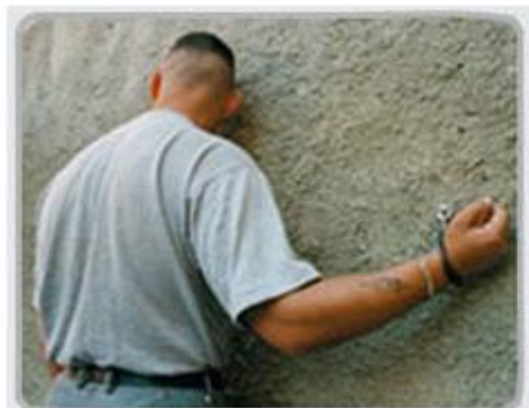
Images: fixed restraints, including "Bouquet" restraints

promoted a restraint bracelet incorporating a single handcuff and a "stationary mount in the form of a rock bolt". According to the company information, this restraint device "allows you to restrict freedom of movement" of the detainee who will be "securely chained…to the wall." The company has also manufactured "Bouquet" bracelets for restraining up to five detainees together that allows the "possibility of fixing [a] group … to a fixed support." "xivii