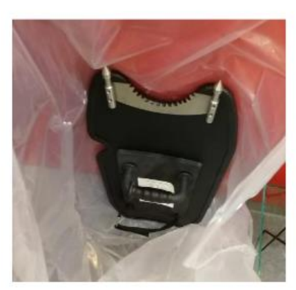
Image: Inherently abusive spiked shield discovered at an arms and security equipment trade fair held in an OSCE participating State in November 2019.

At an arms and security trade fair held in the same OSCE participating State in 2019, four third country companies were discovered promoting inherently abusive hand-held kinetic impact weapons. Arm shields with metal spikes were advertised in catalogues displayed at the fair, and another third country company also promoted a round shield that had metal spikes. In addition, one third country company attempted to physically display a spiked arm shield on its company stand. This was discovered by the organisers just prior to the opening of the fair and the company asked to remove it. Unfortunately, the shield was not confiscated nor was the company stall closed.