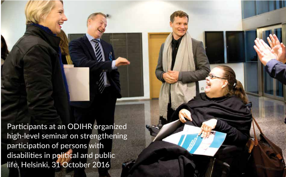
Participants at an ODIHR organized high-level seminar on strengthening participation of persons with disabilities in political and public life, Helsinki, 31 October 2016