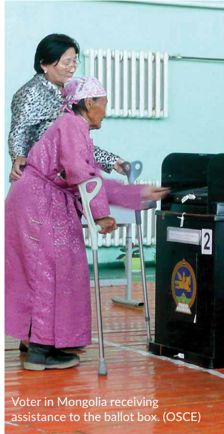
Voter in Mongolia receiving assistance to the ballot box.

The UN Convention on the Rights of Persons with Disabilities has been signed or ratified by 54 out of 57 OSCE participating States.