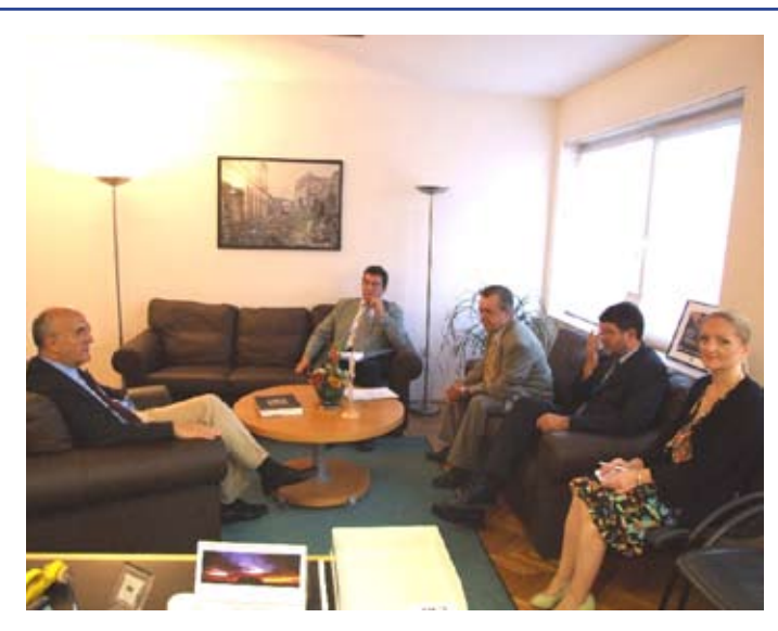
Head of the Delegation of the Croatian Parliament to the OSCE Parliamentary Assembly Tonino Picula spoke of the democratisation of Croatia at MHQ, 5 September 2006.