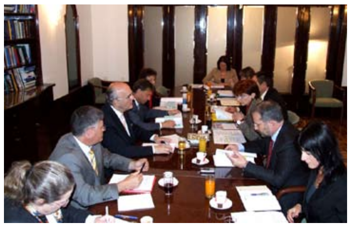
The Croatian Government's obligations towards ensuring rule of law were discussed at a Plenary Session at the Justice Ministry, 15 May 2006.