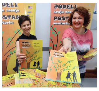
Gender equality is a key area of the Mission's activities. The Mission supports a women's mentorship programme to help women mentees reach their potential.