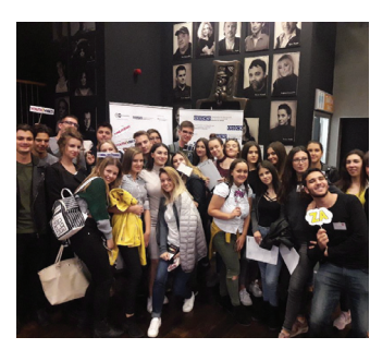
Youth empowerment is one of the areas the OSCE Mission to Serbia is devoted to. Through various regional forums and workshops, digital skills and media literacy among young people are being promoted.