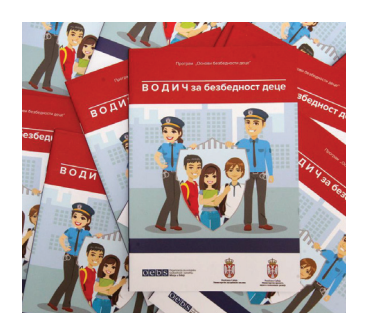
The Mission works on promoting child and youth safety. The Basics of Child Safety handbook, a guideline for schoolchildren, teachers and parents has become accessible as a digital version - for now in Serbian, and very soon in eight minority languages.