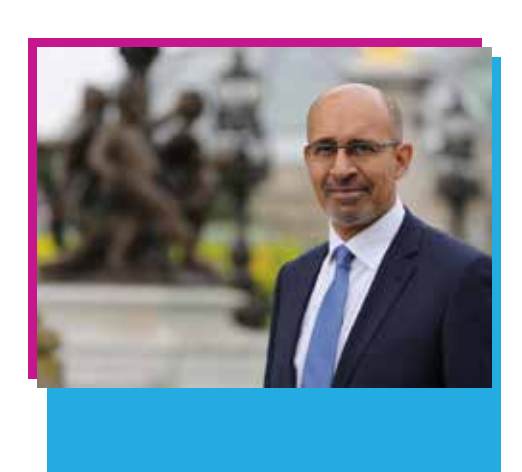
HARLEM DÉSIR OSCE Representative on Freedom of the Media