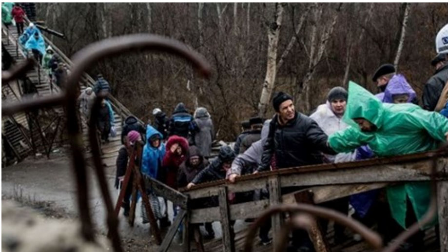
Civilians crossing the destroyed Stanytsia Luhanska bridge in Luhansk region