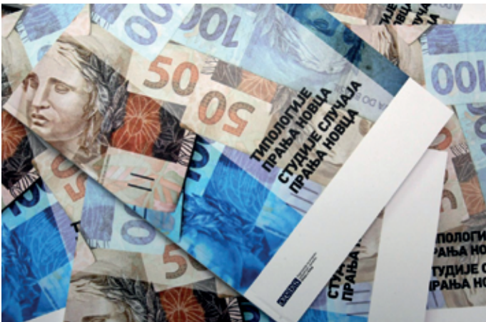
Among the OSCE Mission's activities is publishing best practices to raise awareness about mechanisms for preventing corruption, and equipping prosecutors and investigators to effectively conduct corruption cases.

The Mission, originally named 'OSCE Mission to the Federal Republic of Yugoslavia' was first renamed 'OSCE Mission to Serbia and Montenegro' in 2003. With the dissolution of the State Union of Serbia and Montenegro in 2006, the Mission changed its name to the 'OSCE Mission to Serbia'.