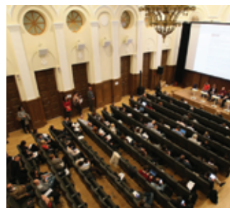
Through conferences and workshops, the Mission works on advancing the freedom of expression in the digital environment.