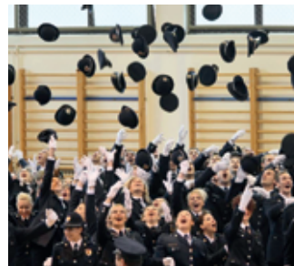
The OSCE Mission assists the host country's police in transitioning to a more effective, representative and accountable police service.