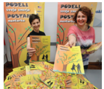
Gender equality is a key area of the Mission's activities. The Mission supports a women's mentorship programme to help women mentees reach their potential.