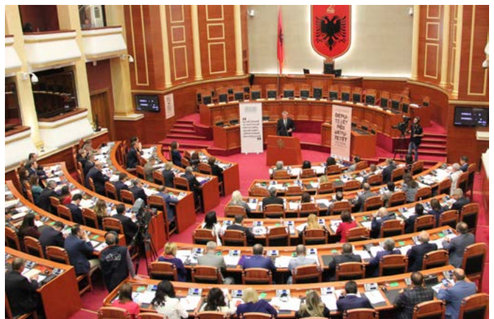
The Presence has assisted local partners in many important legislative efforts over the past decade, including supporting the drafting of a code of conduct for lawmakers in the Albanian Parliament.

In the long-term, active citizens are the best monitors of their own democracy.