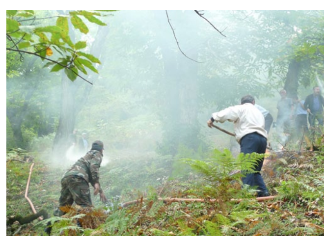
A practical exercise during a training course on wildfire management in Qabala, Azerbaijan, 24 September 2012 The training was organized by the OSCE within the framework of the ENVSEC initiative.

External presentation of the interaction is important. This can be achieved through joint presentation to donors in terms of fund raising and reporting. Reciprocal representation can be organized.