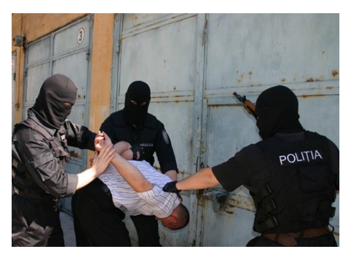
Arresting the 'trafficker' was the final step after two weeks of evidencegathering during a training course on anti-trafficking for police in Chisinau, Moldova, 30 May 2005.

limitations. For example, in terms of visibility, an organization's other co-operation agreements and its internal rules and procedures could be included. The overall agreement, an important tool of transparency, should be straightforward, practical and user-friendly thereby allowing for its daily use.