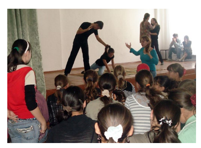
A young audience watches an interactive performance on the theme of human trafficking, in Moldova, 11 September 2008.

Websites on the overall co-ordination or co-operation framework, such as the one used by ENVSEC (http://www.envsec.org), or on specific projects are useful to inform the larger public, as well as researchers and journalists. They should be user-friendly and regularly updated to contain the most recent developments. Even if minutes or matrixes are saved on the website, experience shows that very few staff members consult the website, giving preference to email exchange instead. In contrast, providing all information online may decrease the incentive for staff to attend meetings. A database containing all material, for example, on in-country training, and publications of all partners can be still useful for institutional memory and mutual learning.