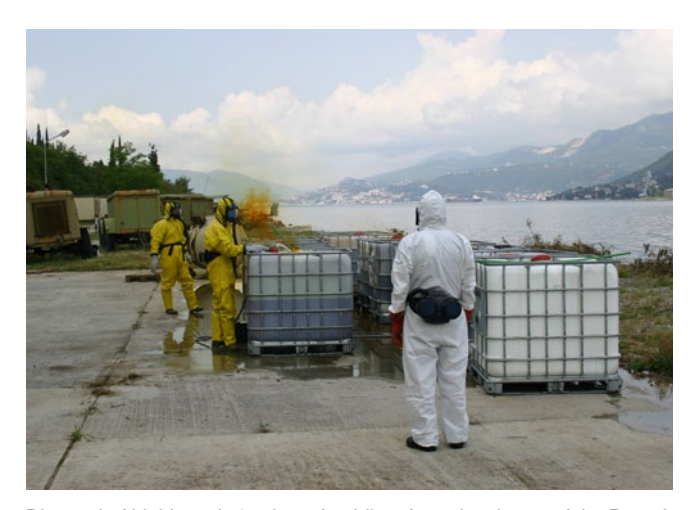
Disposal of highly toxic 'melange' oxidizer from the shores of the Bay of Kotor.

The desire for co-ordination or co-operation can be a part of organization-wide work plans to facilitate efforts in the field by ensuring the necessary buy-in and continuity. In that regard, the activities to combat trafficking in human beings in Moldova are justified by the strategic OSCE Action Plan to Combat THB and the OSCE Action Plan for the Promotion of Gender Equality. The support of the Secretariat/headquarters in such efforts helps to provide legal and policy support for the development of co-operation agreements. The Secretariat/ headquarters could also share good examples of co-operation agreements in different regions or on other topics to encourage learning and avoid reinventing the wheel.