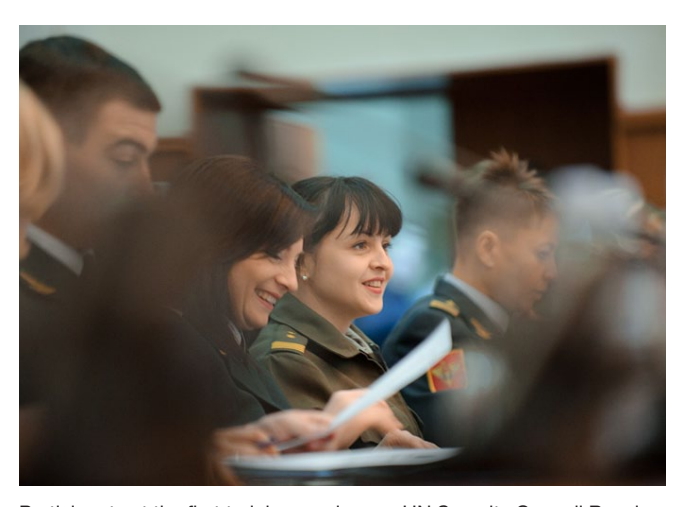
Participants at the first training seminar on UN Security Council Resolution 1325 on Women, Peace and Security held by the OSCE Mission to Moldova and ODIHR, Chişinău, 8 December 2011.