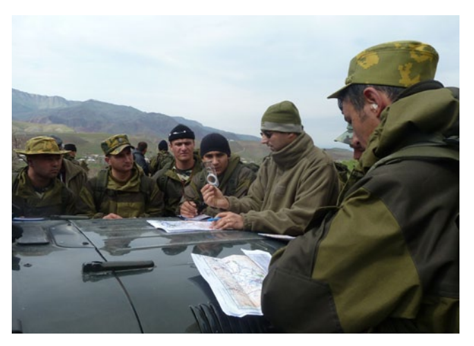
A practical exercise as part of the Patrol Programming and Leadership Project developed for Tajik border troops and Afghan border police within the framework of Tajikistan National Border Management Strategy.

Agreements should be accompanied by a feasible and resource-supported implementation plan. For example consistent local procurement by the international community should be a must. In fact, the elaboration of national strategies can help attract better funding as they ensure a longer-term focus and provide a co-ordinated framework for the resources national actors request from international partners. If necessary, international actors can play a leading role in establishing such strategies, as long as they are based on national priorities. Should national strategies be based on international priorities only, it is highly unlikely they will be implemented or will remain in place over the longer term. A good strategy provides a concrete basis