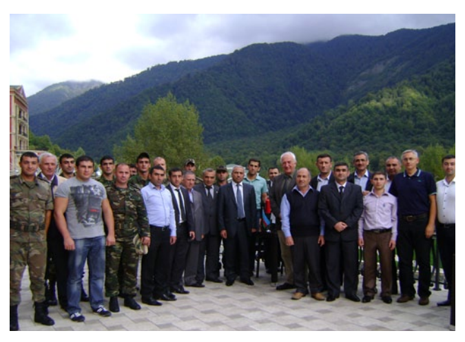
Co-operation within a training course on wildfire management in Qabala, Azerbaijan, 24 September 2012 The training was organized by the OSCE within the framework of the ENVSEC initiative.

Strategies are also important for capacity-building purposes, since they specify a clear end-stage and encourage co-ordination between national agencies. As experience shows, establishing similar national strategies, just as establishing related structures, may take considerable time. Efforts by both national and international actors and its implementation may be challenging. Some host countries may not be familiar with the good practice to formalize agreements in writing or develop long-term national strategies. In that regard, a change in mind set could be needed among the host country authorities.