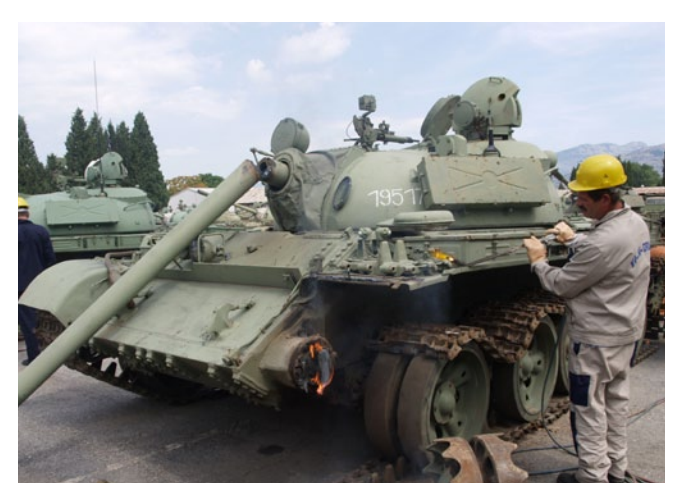
T-55 tank being melted for scrap and recycled as part of the MONDEM Demilitarization Programme.

ance such that differing limitations and strengths of actors become complementary.