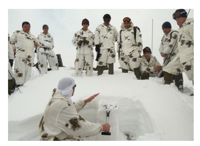
A practical exercise as part of the Patrol Programming and Leadership Project developed for Tajik border troops and Afghan border police within the framework of Tajikistan National Border Management Strategy.