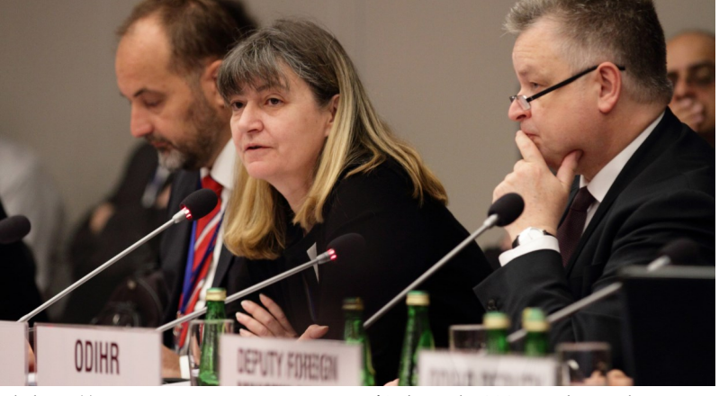
Ambassador Sanja Milinković (c), Deputy Permanent Representative of Serbia to the OSCE, speaking at the Human Dimension Seminar.

More than 100 representatives of governments, international organizations and civil society met in Warsaw from 1 to 3 June to discuss the important role of national human rights institutions (NHRIs) in promoting and protecting individual human rights at the three-day OSCE Human Dimension Seminar, organized by the OSCE Office for Democratic Institutions and Human Rights (ODIHR) in co-operation with the 2015 Serbian Chairmanship of the OSCE.